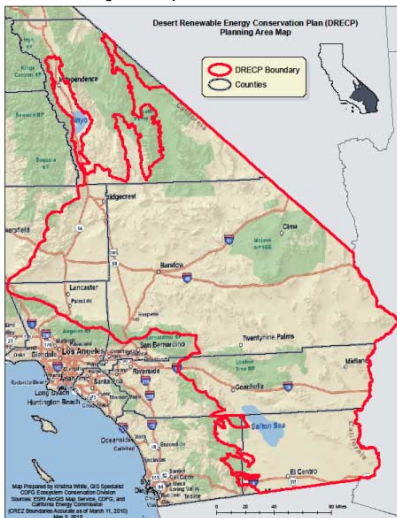
DRECP Planning Area Map

The DRECP is a work in progress. It will be a better plan if stakeholders are part of the process. Antelope Valley Conservancy is awaiting funding of a grant that will help engage and empower community participation, specifically, to fund meetings, travel to meetings, legal services, printing, copying, and more. We will have more news on this soon.